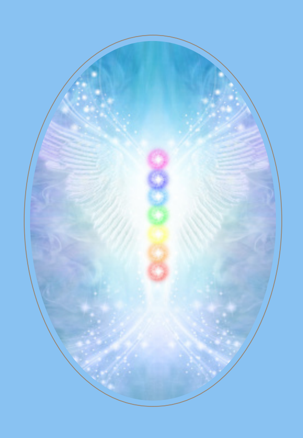
As you experience life,

the aim is to learn the lesson associated with each centre and raise the energy through the central channel. As it reaches the crown, this is when the integration takes place and the heightened spiritual energy )I AM source. God) flows back down and you are intrinsically changed. You feel at great peace and connection. Purpose.